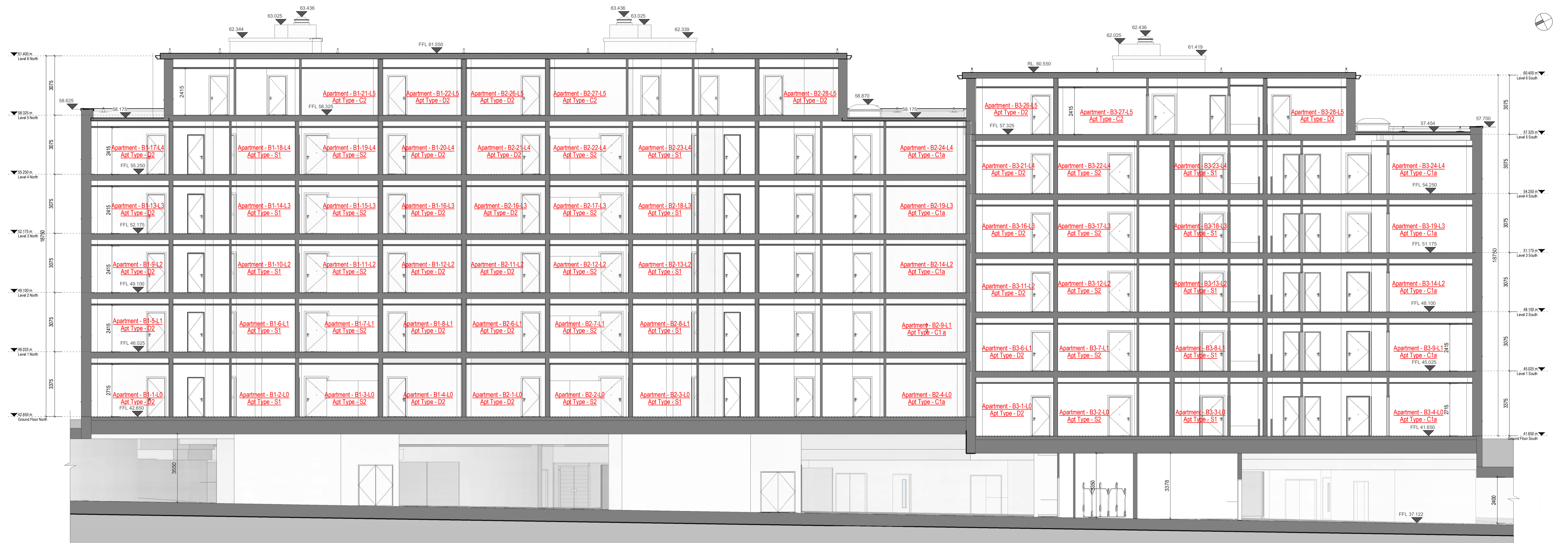
1 GA - Section AA 1 : 100